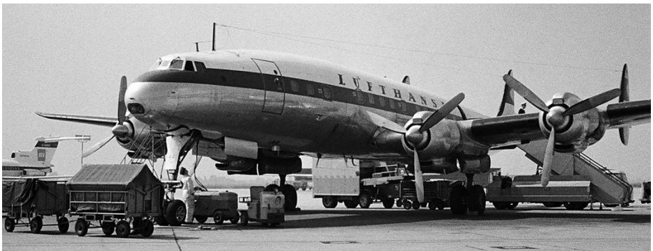
Lockheed L-1049 Super Constellation aircraft – 1950 – pre jet era.

I was allowed to go down the aisle passing out handkerchiefs filled with candy, chocolates, and sugar-coated nuts. I still remember that day, and reflect on it often, as it felt special and personal. It proves one thing to me – your life experiences – regardless of how long ago they may have occurred – help build the person you become.