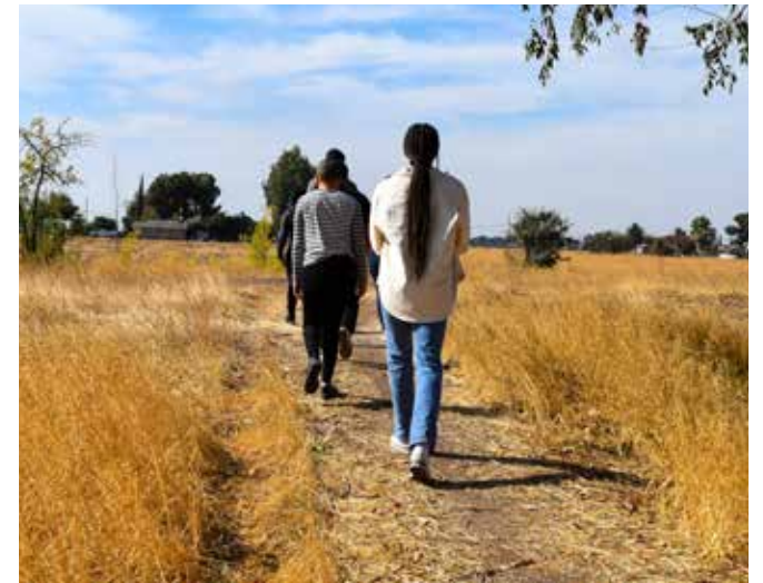
Open field in Seville which has not been developed due to lack of sustainable water access for the community