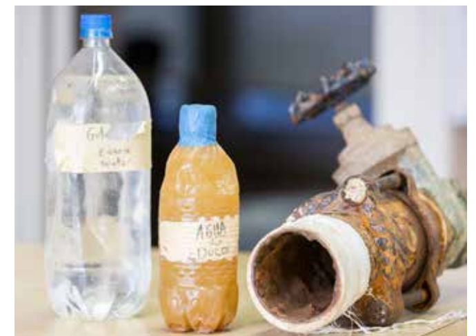
Bottles show nitrate contaminated drinking water (left) vs water that is safe to drink but has secondary contamination (middle).

The Irrigated Lands Regulatory Program (ILRP), overseen by the Regional Water Boards, was created in response to 1999 legislation that eliminated agriculture's long-standing unconditional waiver of pollution standards in their discharges. 12 Initially, the program only sought to reduce nitrate contamination in surface water. In 2012, the ILRPs in the Central Valley and Central Coast were amended to address discharges to groundwater as well. In the Central Valley, individual dischargers largely comply by enrolling in one of 13 coalitions. These coalitions provide education, data collection and guidance to help individual dischargers comply with discharge requirements. Coalitions also set targets for the level of nitrates discharged to groundwater and collect and disseminate information about best management practices to meet these targets. This polluter-driven process is slow-moving and a cause for concern. We are not confident the ILRP will reduce nitrate contamination quickly enough to meet the needs of impacted residents. One benefit of the ILRP is that all on-farm wells must be tested for nitrate; the data provided from those tests tell us that over a third of on-farm wells are, unsurprisingly, contaminated.