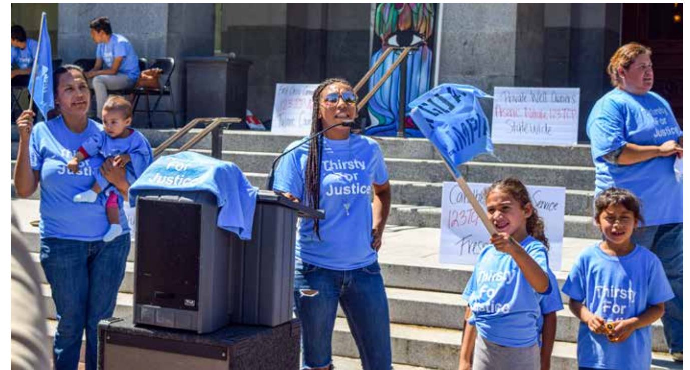
Community members traveled to Sacramento multiple times over three years to push for the creation of the Safe and Affordable Drinking Water Fund!

Whether addressing known constituents and their health risks or discovering new harmful substances, human health must be prioritized when making policy decisions for long-term mitigation and treatment of drinking water contaminants.