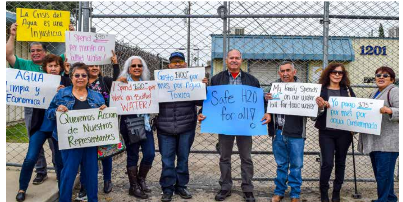
Community leaders rallying for affordable water.