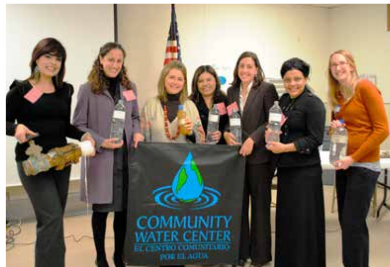
United Nations Rapporteur Catarina de Albuquerque visits Seville, CA in 2011 and determines communities are forced to live in third world conditions due to lack of access to safe water.

Community leaders and activists wanted to change this narrative and enshrine in California law the recognition that unsafe water is a problem plaguing communities and it is the state’s job to fix it. To achieve this, activists from the Central Valley, Southeast Los Angeles, and the faith-based community campaigned in Sacramento