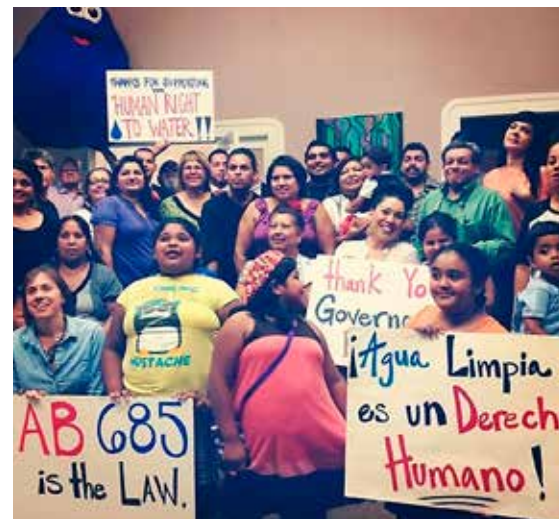
Community partners celebrate the passage of AB 685 in 2012

for almost four years, from the introduction of AB 1242 in February 2009, until Governor Brown signed AB 685 (Eng) in September 2012.