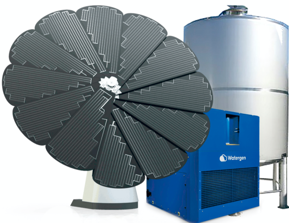
239 GPD System

GridZero Inc. can design an Atmospheric Water Generating (AWG) system, built by Watergen the world leader in proven air-to-water technology. Whether you need 50 or 1,500 Gallons Per Day (GPD), want to operate using solar, a generator or go off the local power grid, we have the right solution to fit your need and budget.