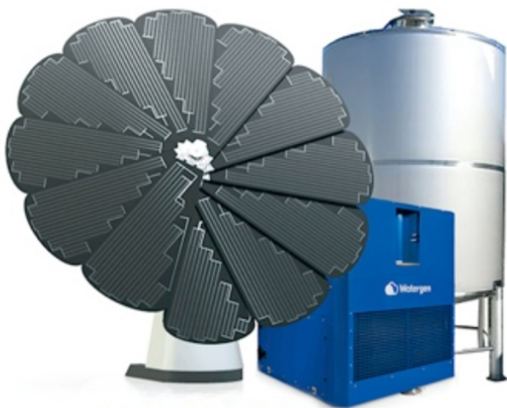
239 GPD System

GridZero Inc. can design an Atmospheric Water Generating (AWG) system, built by Watergen the world leader in proven air-to-water technology. Whether you need 50 or 1,500 Gallons Per Day (GPD), want to operate using solar, a generator or go off the local power grid, we have the right solution to fit your need and budget.